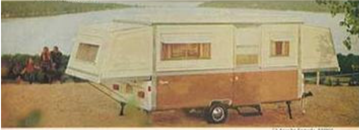
Apache Hardtop, $1100*