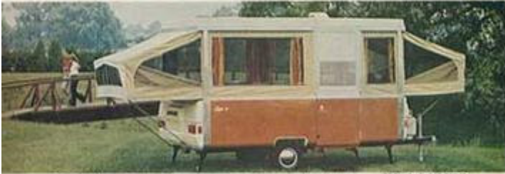
Apache Eagle II, $1000*