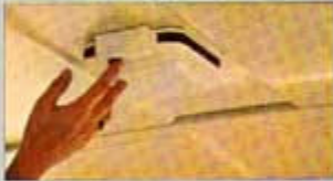
Apache doesn't keep you in the dark. Ceiling lights come with all models.