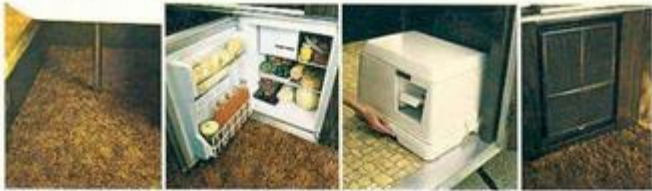
Wall-to-wall shag carpeting adds a living room look to your Apache. Refrigerator has 2 cubic foot capacity, runs on 12-V current or bottled gas. Pure-Fit® thermal toilet has self-contained water supply. Automatic blinds with flower letter box make an eye-right.