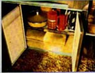
Storage space. It's one thing you get plenty of in a Solid State Apache.

inum. So are the interior cabinets. Floors are covered with easy-cleaning cushion vinyl. Sinks are gleaming stainless steel. Mattress covers are stain resistant. Table and cabinet tops have a finish that resists practically everything.