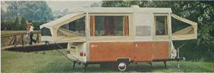
73 Apache Eagle 8, $1995*