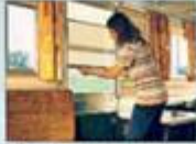
Turn-opening screened door has an automobile translucent panel for privacy.

slide open for ventilation. And Nainbrite draperies that slide over the windows for privacy. It's the security of a lockable, all-metal, screened door.