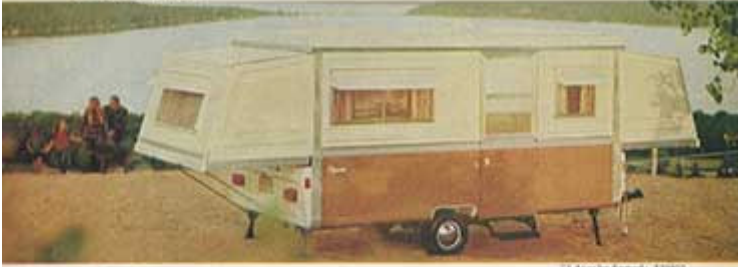
73 Apache Apache, $1995*