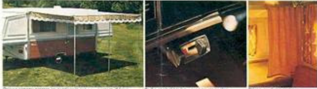
Deluxe canopy protects an outdoor living area protected from sun and rain. Includes frame and support poles. Sink control lets you operate toilet brakes from a lever on the (instrument panel). Privacy curtains come in pairs for both bed areas.